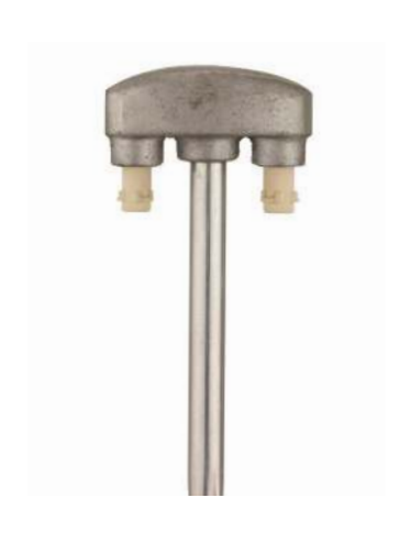
Dual Inverted DMI